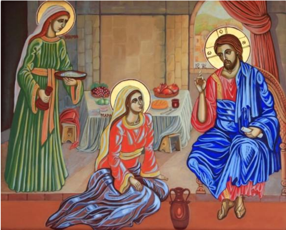
The Home of Martha and Mary

“You all say, ‘The times are troubled, the times are hard, the times are wretched.’ Live good lives, and you will change the times by living good lives. You will change the times, and then you’ll have nothing to grumble about.” - St. Augustine