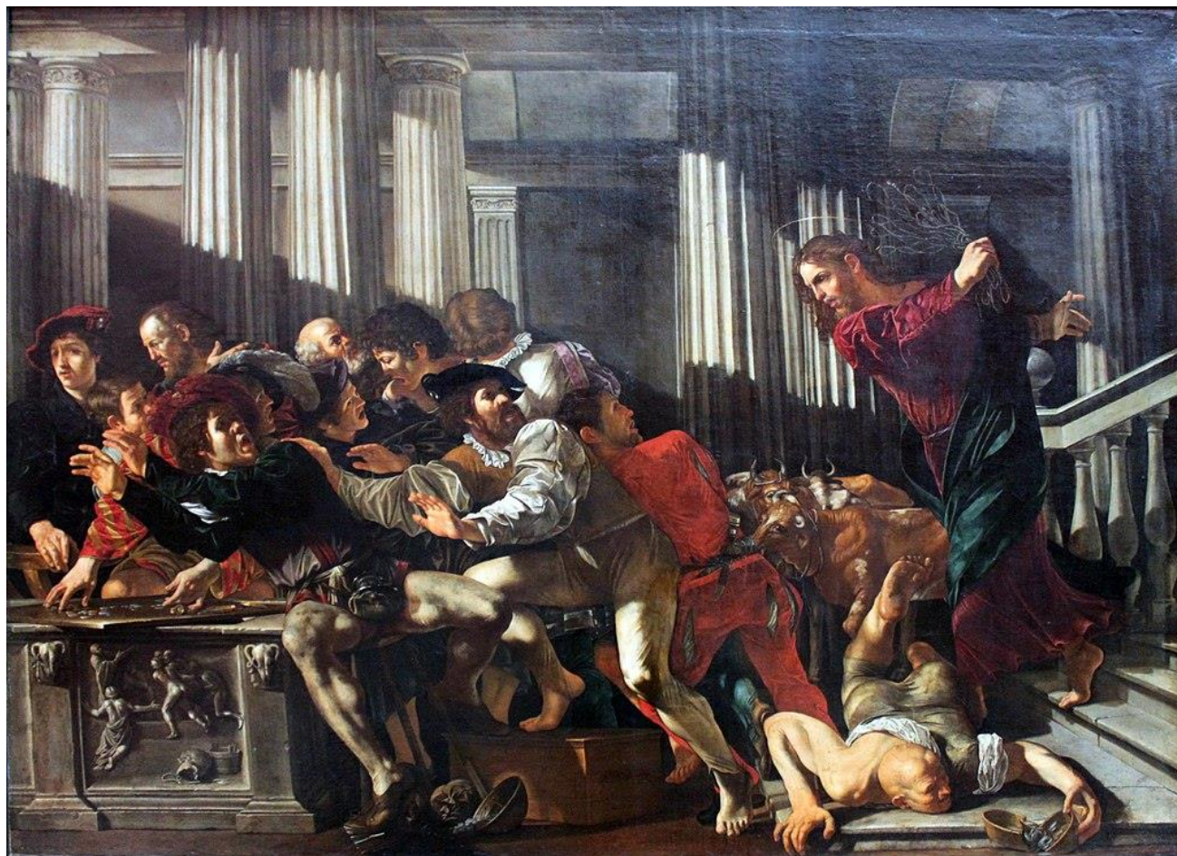
Cecco del Caravaggio Christ driving money changers from Temple (1610)