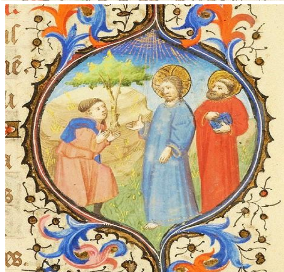
Bedford Master. Jesus Encounters the Man Born Blind From a Book of Hours French (Paris), c. 1430-1435 New York, Pierpont Morgan Library MS M 359, fol. 85t