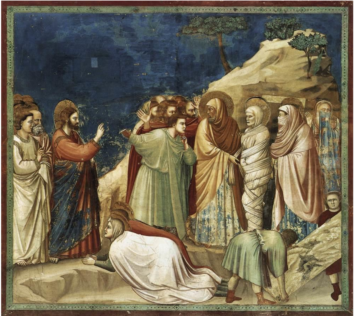
GIOTTO di Bondone (1304-06): Scenes from the Life of Christ: Raising of Lazarus